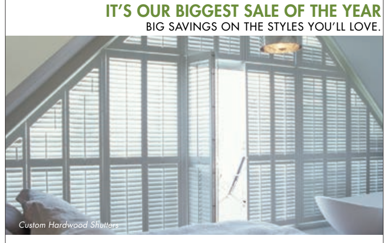
Incredible Savings, Promotions, and Upgrades On

(925) 254-7553 www.OrindaAcademy.org "Inspiring success – Fulfilling potential" 19 Altarinda Road, Orinda, CA 94563